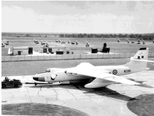
Valiant bomber at RAF Marham; the airfield was protected by a Bloodhound missile system (in the background).